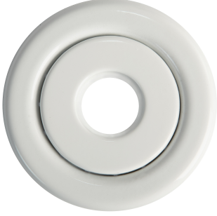
İki Parçalı Rozet