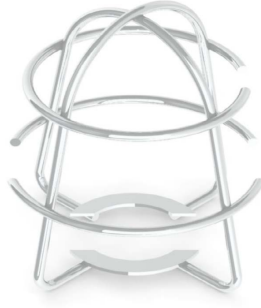
Kromajlı Sprinkler Kafesi